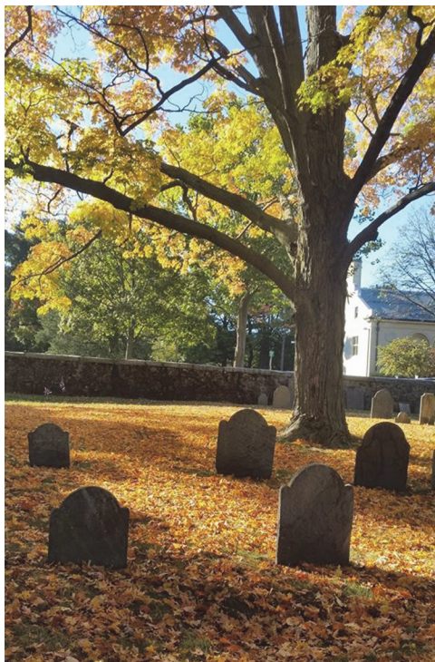
Old Burying Ground in Arlington Center.