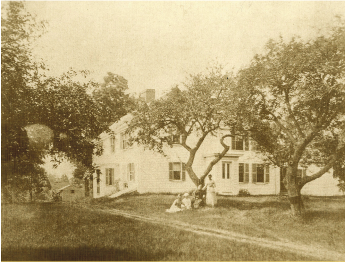
One of the oldest photos of the Jason Russell House, c. 1870-1880

The Arlington Historical Society was recently awarded a $15,000 grant to conduct a Preservation Study of the Jason Russell House. The grant, from Massachusetts Preservation Projects Fund through the Massachusetts Historical Commission, is a matching reimbursement program for properties listed in the State Register of Historic Places. The $15,000 will be matched with $15,000 from the Arlington Historical Society will be devoted to a planned Preservation Study. The study is needed to document existing conditions and to determine the plan and requirements for continued preservation and immediate stabilization of some weakened parts of the House structure. The Society welcomes contributions to help with the matching funds. If you would like to contribute to matching