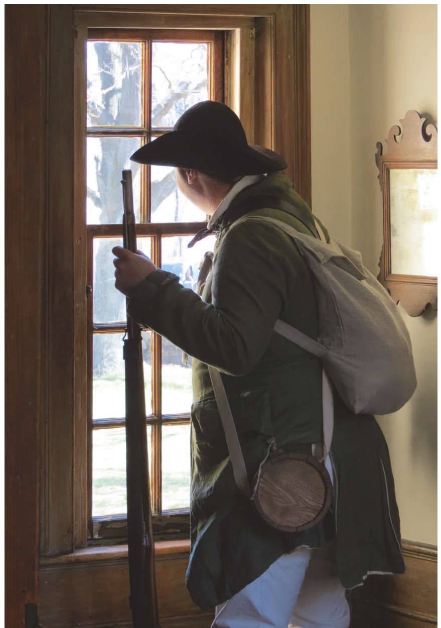
A re-enactor looks out of the Jason Russell House window, keeping an eye out for British "regulars" on the march during last year's re-enactment.

Mark your calendars and plan on attending this beloved Arlington institution again this year. ❖