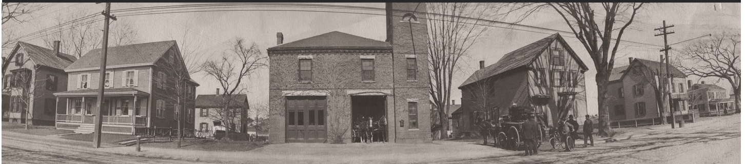
A circa 1910 panoramic view of Massachusetts Avenue, featuring the old Highland Fire Station building.