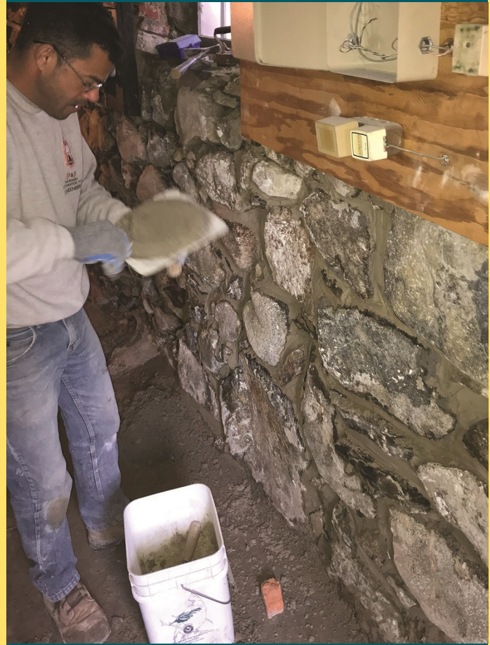
A mason from PMF Masonry repoints the foundation stones along the north wall of the Jason Russell house. Some of the old mortar had decayed to dust and sand, requiring remediation.