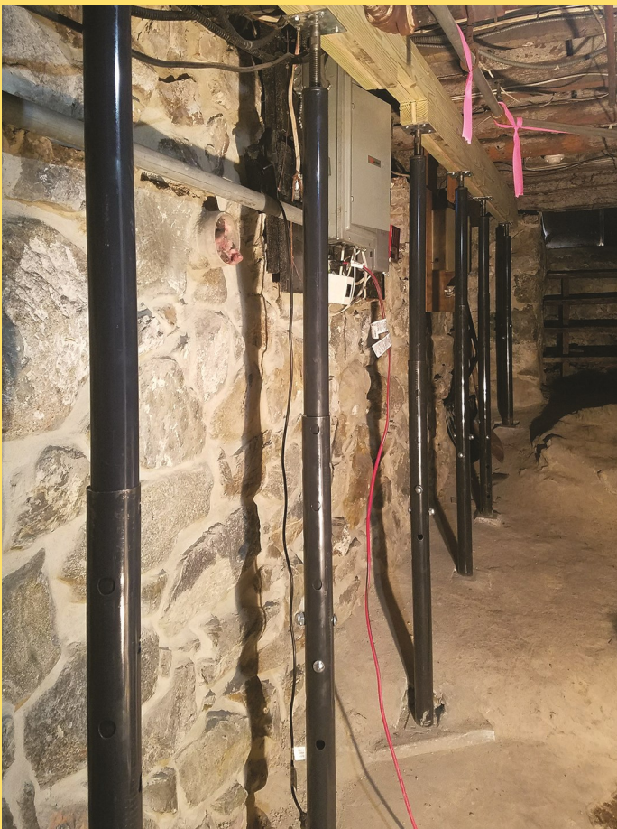
The new lally columns in the basement of the Jason Russell House. These poles partially support the floor joists along the north wall of the house. Ordinarily, the joists rest on the sill of the house (atop the stone foundation wall). However, because the sill had rotated due to the house's settling, additional structural support is needed.