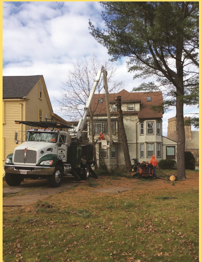
Two trees were removed from the yard adjacent to the Jason Russell House. They were removed because both trees were dropping needles into the house's gutter, clogging it. Moreover, one was leaning towards the house, and project supervisors worried that it might fall onto the house in a wind storm.