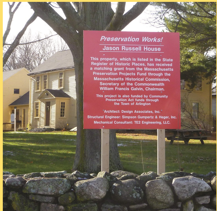
The Society was proud to display the distinctive "Preservation Works!" sign seen at other important project sites across Massachusetts.

All this work is the direct result of the generosity of the Community Preservation Committee of the Town of Arlington, and the Massachusetts Preservation Project Fund. The judicious use of taxpayer funds to restore this unique part of the history of the American Revolution is gratefully acknowledged by the Arlington Historical Society, which has been the faithful steward of this house for public benefit since 1923. ❖