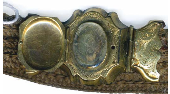
Bracelet used to commemorate “Clemmie Morrison” who died in 1854.