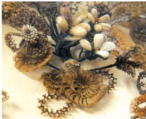
Detail of Mary Alden’s hair wreath

The floral wreath shown above and at right is an example of the former – an item typically made from the hair of multiple people was a way to use easily found materials and a way to commemorate loved ones. Think of it as a sort of family tree. Note the various colors of hair included in the detail photograph of this wreath, including many gray hairs – this shows that it was made from the hair of multiple people. Patterns and the materials to make such works of art were commonly available in stores or women’s magazines. Hair made an excellent found material for such artistic ventures, it was an age where women took pride in their long tresses, and there were few other ways to pay homage to your loved ones. The magazine