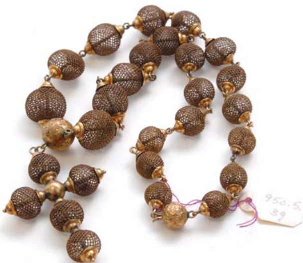
Hair bead necklace from Robbins Sisters Estate